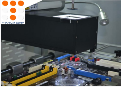
Split optics for repeatable and accurate positioning

Perfectly align your BGA, CCGA, QFN, CSP, LGA, or other SMD