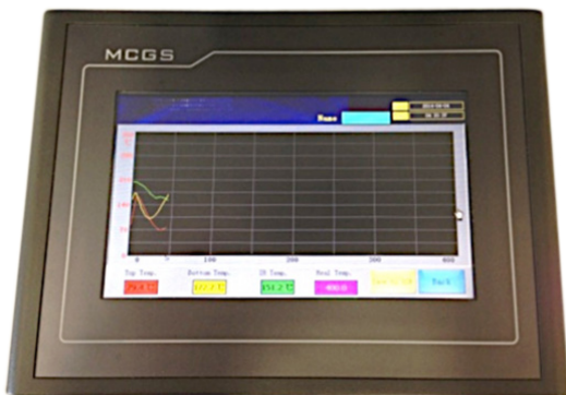
Fully embedded control & monitoring software

The touch screen embedded computer displays the temperatures of all heaters for a comprehensive understanding of the temperature profile. An additional high accuracy K-type close loop thermocouple with automatically adjustable PID parameters assures a temperature envelope not larger than \pm 2^{\circ}\text{C} from the set point.